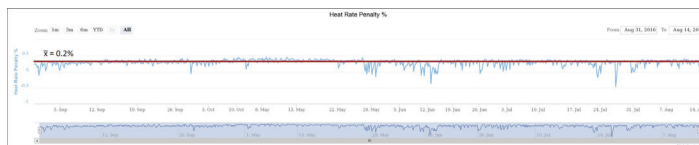
Figure 2: The dispersant program held the gains through the summer of 2016.

The May 2017 Heat Rate, the overall metric of power plant performance, was 2% lower than in May 2016 before the implementation of the dispersant program. The monthly fuel savings associated with maintaining the gains was $145,000 4 , compared to the prior May. Data from the OMNI program indicated continued excellent performance through the summer of 2017 5 . The total fuel savings for the initial 9-month period was $1 million.