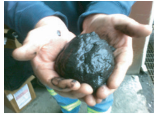
Figure 2 - Untreated coal refuse slurry (above left) is typically low in solids and highly fluid, as evidenced by the rapidity of slurry solids runoff. As laboratory tests for “slump” characteristics have shown, OreBind treated slurry is far more manageable (center and above right). Treated slurry solids set up rapidly and release water far more quickly, facilitating more rapid recycle of impoundment space / slurry cell capacity