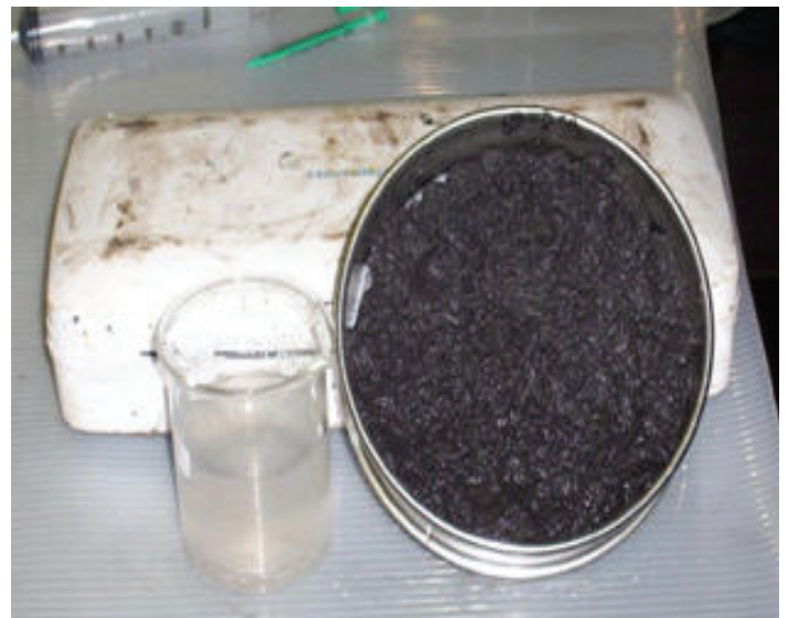
Figure 1 - Lab tests are first conducted to confirm the required chemical dosages as well as the volume and clarity / quality of water liberated by via the OreBind technology program. Above are examples of the lab test results.