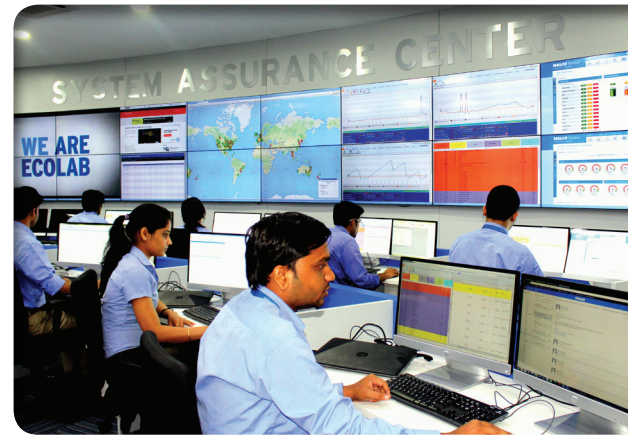
Nalco Water's System Assurance Center